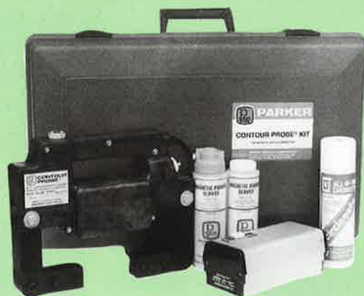
DA200-AB KIT SHOWN

Contour Probe Kits —are available with Dry Powder and Wet Fluorescent inspection mediums, including Black Light, all in one easy to carry case. A truly portable one-man inspection package.