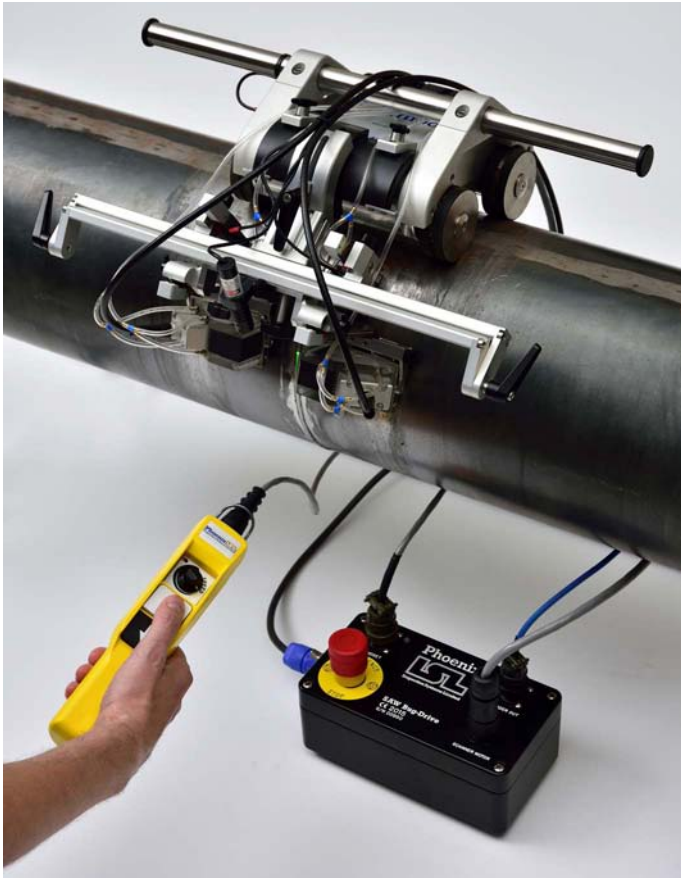
SAW Bug inspecting a 10"OD weld with TOFD and phased array probes