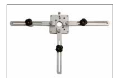
XY table including long arms

Centering bracket for laser transmitter during bore measurement