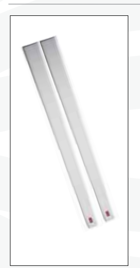
Fixtures for transmitter 800 mm Arms for transmitter fixture 800 mm