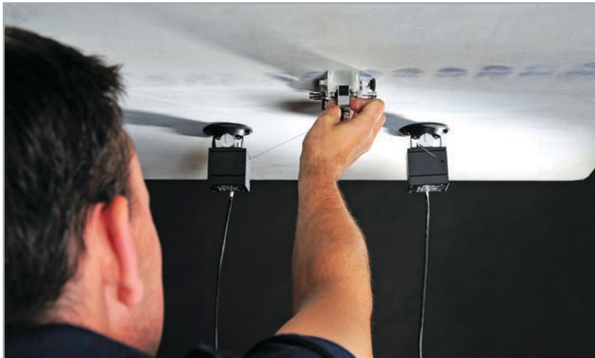
Tracer - Inverted scan inspection

Tracer is a versatile freehand scanning system that calculates and outputs accurate X-Y positional data for C-scan inspections without the constraints of a scanning frame. Tracer is ideally suited to operate with linear array probes to provide a fast, simple and flexible portable C-scan inspection kit.