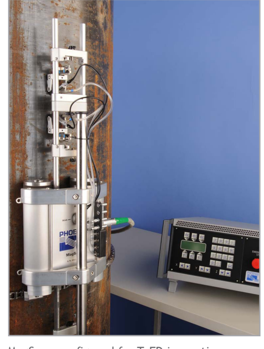
MagScan configured for Girth Weld Inspection