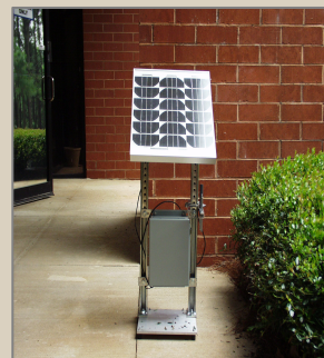
Solar Powered Outdoor DRM